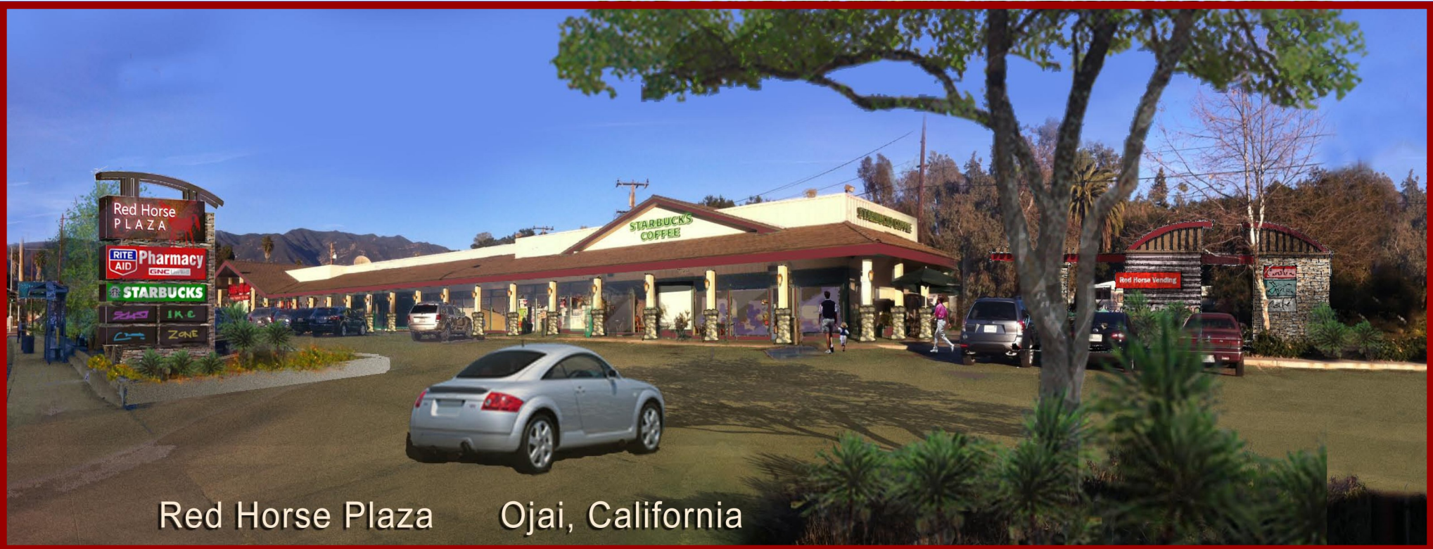
Red Horse Plaza Ojai, California

11484 - 11496 N. VENTURA OJAI, CALIFORNIA